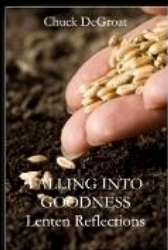
Falling into Goodness: Daily Readings for Lent