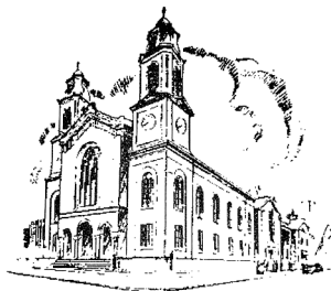
FOUNDED IN 1642 "OLDEST PULPIT IN AMERICA"

Prayer Concerns? If you would like your church family to join you in prayer, please share your concerns and joys with us. Call the office at 518-463-4449 or email office@firstchurchinalbany.org