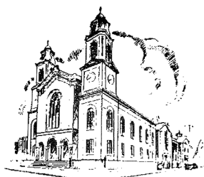
FOUNDED IN 1642 "OLDEST PULPIT IN AMERICA"

Deadline for the Family: Please submit information for the Family by January 20 th for our February issue. We ask that you keep your submissions concise so that we can include each request. Thank you!