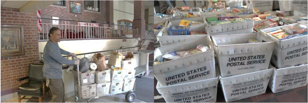
Photos of the food delivery from the Saturday, May 9 th Post Office Food Drive.

The First Church Food Pantry received over 110 post office totes full of non-perishable food items thanks to the Albany County Post Office. Special thanks to the post offices for such a huge success. Our pantry guests will have plenty to choose from for many weeks.