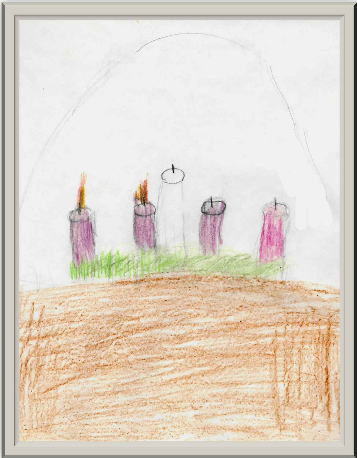
"Clover's Peace" by Clover Pagerey