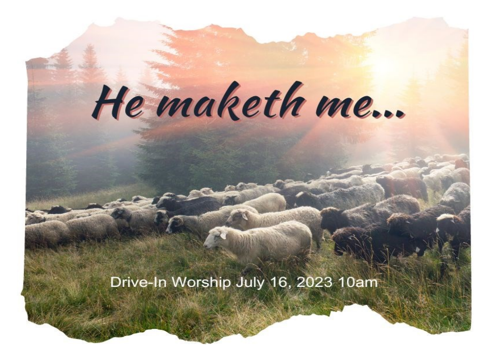
Radio Station: 87.9

Prelude "The Well-Tempered Clavier, Book 1, No. 9 " J.S. Bach